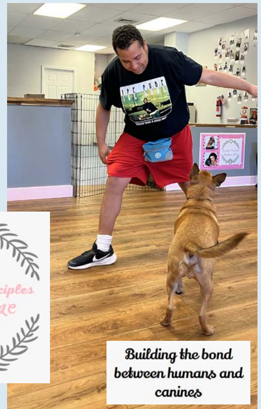
Building the bond between humans and canines