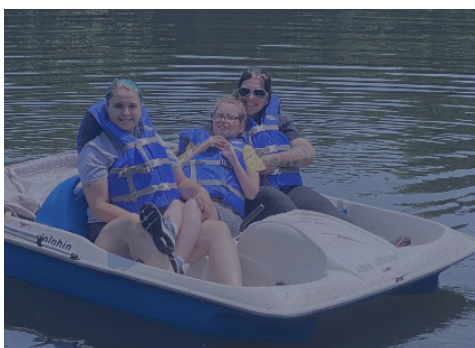
Join A Committee

Pony Bird offers a number of committee opportunities for community members to be active and engaged in enriching lives of individuals with disabilities. From an advocacy committee to the development committee to event committees there is most certainly a spot for you. Give us a call today!