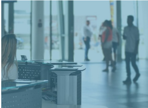
Attend or Sponsor an Event

One of the most direct and effective ways you can help Pony Bird is to make a monetary gift. Your donation will help us purchase things like equipment and/or provide the items that benefit the quality of life for the individuals that live at Pony Bird. But some of the other ways that you can help are described below.