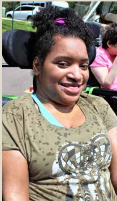
Santriel and Misty not only stayed safe during COVID, they had a lot of laughs with staff.