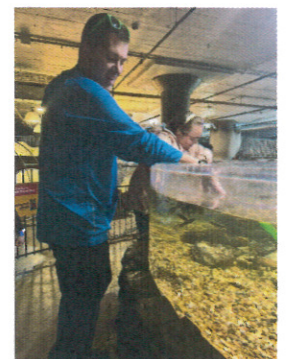
CITY MUSEUM AND SCIENCE CENTER