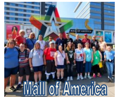
Mall of America

If you have an idea for a fun-filled trip, please list your suggestion on the registration form. We will take all suggestions into account with hopes to offer a trip that will guarantee a good time for all. We now begin the process for another adventure!! Look for our 2024 vacation announcement soon.